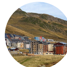
Pas de la Casa

This simple hike takes you to Pic Blanc d'Envalira. The peak is surrounded by Pic d'Envalira and Pic Negre d'Envalira.