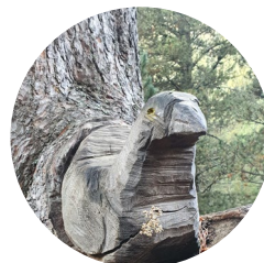
Cockerel in the forest

Coma de Ransol: previously a noun from 'ronsejar', from the same root as 'ronc' (related to stony features).