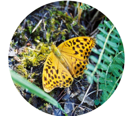
Silver-washed fritillary ( Argynnis paphia )

This excursion begins in the old quarter of the town of Arinsal. In winter, it's one of the Vallnord ski resort's direct access points (directly from the town via the cable car); after snowmelt, it becomes an entry point for hikers wishing to visit the Comapedrosa Nature Park.