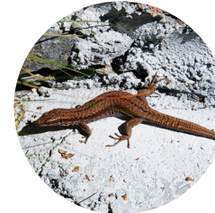
Wall lizard ( Podarcis muralis )