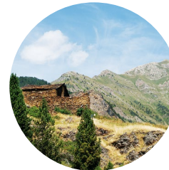
La Capa highlands