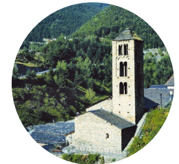
Church of Sant Climent

This simple hike is ideal for completing with the whole family on a hot summer afternoon. Given that the route passes only 800 metres from the idyllic village of Pal, it is well worth paying a visit. You can also see the church of Sant Climent and the Romanesque interpretation centre.