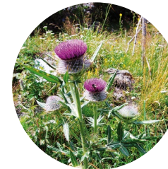
Woolly thistle ( Cirsium eriophorum )