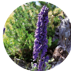
Monkshood ( Aconitum Napellus )

Pal: From the Latin palu , meaning “stick”. This village is close to the western border. In previous times, people could get disoriented when great snowfalls and storms hit. High and thick perches were set up to avoid this. The Catalan word pal forms part of many place names in the Pyrenees.