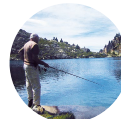
Fisherman on Blau lake

This route runs along the 2.1-hectare Blau ("Blue") lake, misnamed because its waters are cloudy and slight greenish.