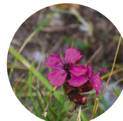
Maiden pink ( Dianthus deltoides )