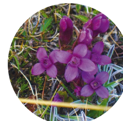
Field gentian ( Gentiana campestris )