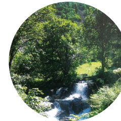
Claror i Perafita rivers