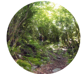
Boïgot fountain path

The Entremesaigües route is located in the Madriu-Perafita-Claror valley in the Escaldes-Engordany parish. The parish extends along southeastern Andorra. It is bordered on the north by the Encamp parish and a bit of the la Massana parish, and to the west on the Andorra la Vella and Sant Julià de Lòria parishes, with which it shares some vague borders.