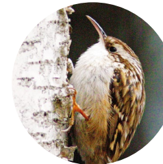
Boïgot fountain path ( Certhia brachydactyla )