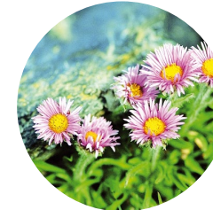
One-flower fleabane ( Erigeron uniflorus )