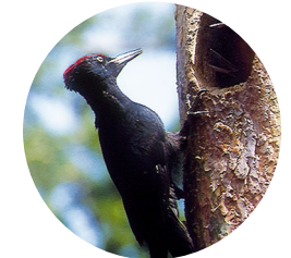
Black woodpecker ( Dryocopus martius )

Pic de Comapedrosa is the highest peak in Andorra. It's located in the Valls del Comapedrosa Communal Nature Park, which covers 1,542.6 ha (15.42 km 2 ). It belongs to the parish of La Massana, in Arinsal.