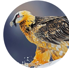
Bearded vulture ( Gypaetus barbatus )