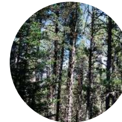
La Gonarda forest