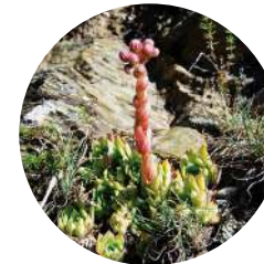
Houseleek ( Sempervivum Montanum )