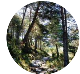
Els Cortals path

The Solà path is in the parish of La Massana, between the towns of Anyós and L'Aldosa. This particular excursion passes through the forests of La Massana, among silver birches, hazels and a number of other alpine species. From 2,000 m in elevation upward, scots pines become more commonplace. The view is extraordinary from the Collada de l'Estall mountain pass, particularly of the Peak of Casamanya and the Cortals de Sispony farmhouses.