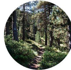
El Campeà forest