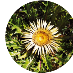
Acanthus-leaved thistle ( Carlina acanthifolia )