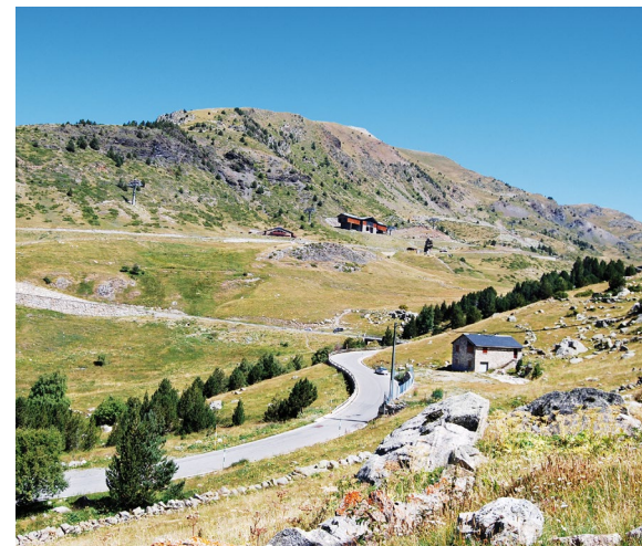
* This is a circular route. There is also an option to return directly from the El Campeà springs to the starting point.