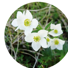
Buttercup ( Ranunculus pyrenaicus )