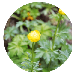
Globeflower ( Trollius europaeus )