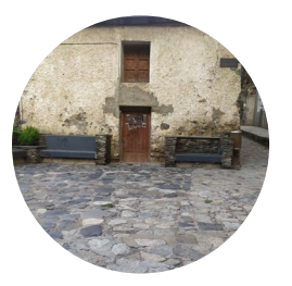
Carrer de la Font