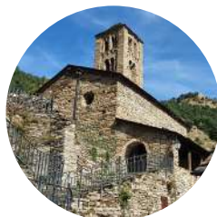
Sant Climent de Pal