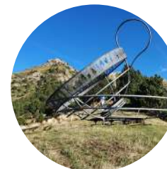
Tempesta en una tassa de té (Storm in a Teacup)