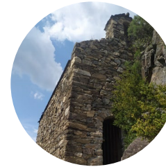
Sant Martí de Nagol church