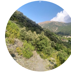
Sant Martí de Nagol's path

This route has moderate difficulty and not much climb. It starts in the very north of Sant Julià de Lòria and zigzags up to the village of Nagol, parallel to the left-hand bank of the river. There are some sections at the start of the route when the path is cobbled and has a protective wall separating it from the farmland. In the village of Nagol, the path joins with another that goes to Sant Martí church. It allows access to multiple terraces on either side.