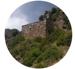
Sant Martí de Nagol

This route starts in the village of Sant Julià de Lòria and climbs to the village of Nagol along Camí de Sant Martí. The path connects the village of Nagol with Sant Martí church and the meadow and the terraces next to this church. Coming out of the very north of the village of Nagol, it flanks the mountain side with a slight slope and goes over a pass in the middle. On either side of this pass, the path is cobbled; there are also some sections above a dry stone embankment. When it gets close to Sant Martí, it's cut by the rock.