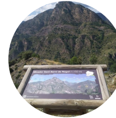
Sant Serni de Nagol's lookout