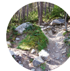
El Cresper path

In the parish of Encamp, you'll find Engolasters lake, fed by the Engolasters river, which itself is a tributary of the Valira river. Legend has it that there was a town full of unfaithful here that was flooded over by the waters. At night, witches met secretly here to bathe naked in the lake. Men from Engolasters would sneak out to spy upon these witches, all the while knowing that if they were caught they would be turned into a black cat. It is said that witches disappeared around the beginning of the 20 th century, coinciding with the installation of the antennas for Ràdio Andorra and the construction of the FHASA hydroelectric dam, which opened in 1934.