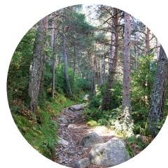
El Cresper path