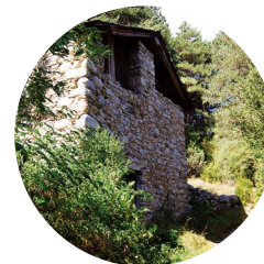
Farm at El Cresper