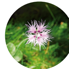
Pink ( Dianthus hyssopifolius )