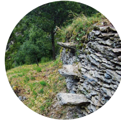
Dry stone steps

La senyoreta: From the Latin word seniore , meaning "elder, person of authority", which is behind the Spanish word señor and its derivations. Here, it is a place name referring to a maiden with dominion. It comes from a nice Lauredian legend about a young lady who, despite the different versions, is always very beautiful.