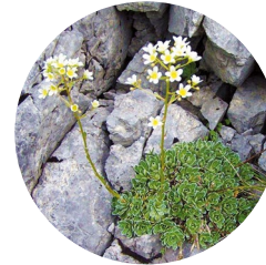
White mountain saxifrage ( Saxifraga paniculata )