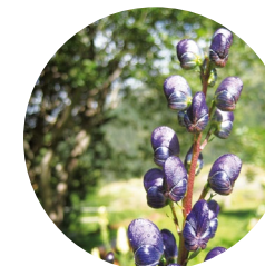
Tora blava ( Aconitum napellus )

The natural landscape of the entire Ensagents valley alternates between open areas and more closed, intimate ones, which are humid and boast a large variety of flowers.