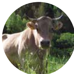
Bruna d'Andorra ("Brown Swiss") livestock

Casamanya: From the Latin casa , "cabin" and magna "very large". A place of idol worship, it was probably the centre of prehistoric, pagan Andorra.