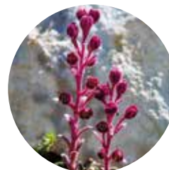
Saxifrage ( Saxifraga media )