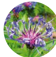
Mountain cornflower ( Centaurea montana )