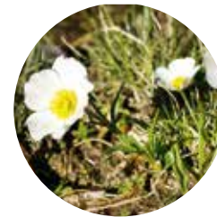
Buttercups ( Ranunculus lanuginosus )