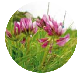
Alpine clover ( Trifolium alpinum )

Juclà lake is in northeastern Andorra, in the parish of Canillo. With a surface area of 120.76 km 2 , it is the first parish in order of protocol, and the largest in Andorra.