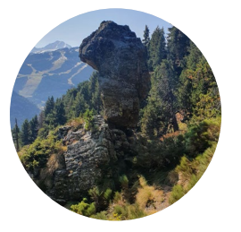
Pla de Bordetes