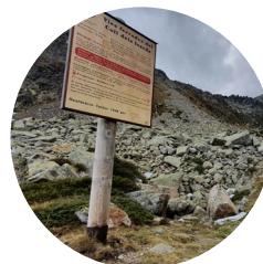
Via ferrata routes