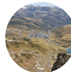
View: Pas de la Casa