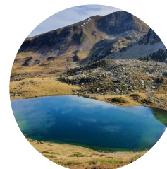
Estany de les Abelletes