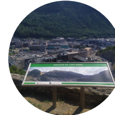
Sant Romà dels Vilars viewpoint

A simple, short walk around the Vilars, one of the villages in the parish of Escaldes-Engordany. The route allows you to explore some old buildings, such as typical mountain bordes or manor houses, which are today the main homes of the inhabitants of Escaldes.