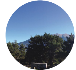
Coll de Rep hill

The Fontaneda path starts in the town of Sant Julià de Lòria, at the Fontaneda bridge. The most common trees here are the European ash ( Fraxinus excelsior ), holm oak ( Quercus rotundifolia ) and downy oak ( Quercus pubescens ). You may also see some European nettle trees ( Celtis australis ) and walnut trees ( Juglans regia ).