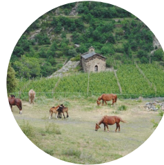
Sant Mateu del Pui d'Olivesa