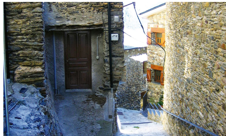
* You can return using the same route in the opposite direction.