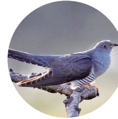
Cuckoo ( Cuculus canorus )