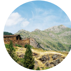
La Capa highlands