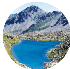
Cap dels Pessons lake