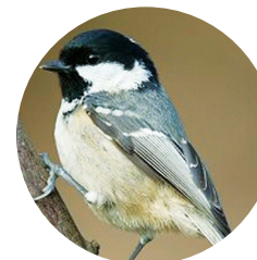
Coal tit ( Parus ater )