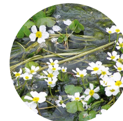
White water buttercup ( Ranunculus aquatilis )

Within the parish of Encamp, the valley that opens to the right and leads to Port d'Envalira, heading toward France, hides a very interesting route through a series of interconnected lakes, with unnamed lakes, streams, rocky cliffs, large meadows and wide panoramic views, all nestling in the heart of the largest granite glacial cirque in Andorra. The GR-7 and GRP share a path through this cirque, which has peaks higher than 2,700 metres, as is the case of Pessons pass (2,810 m).