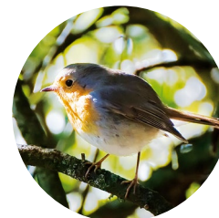
Robin ( Erithacus rubecula )