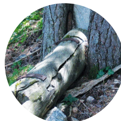
Trough along the path