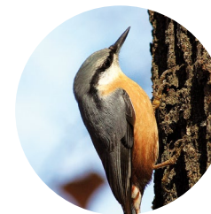
Nuthatch ( Sitta europaea )