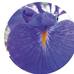
Liri dels Pirineus ( Iris xiphoides )