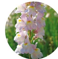
Toadflax ( Linaria repens )

This route begins in the village of Llorts, one of the 8 towns that make up the parish of Ordino (Ordino, Segudet, Sornàs, Ansalonga, La Cortinada, Arans and El Serrat). Here you can discover a forest of Scots pines ( Pinus silvestris ) with large canopies and remarkable diameters, as well as a significant community of birds to watch and hear.