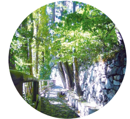
Row of poplar trees

So far, the Rec del Solà irrigation canal and the Rec de l'Obac irrigation canal (located on the shady part of Andorra la Vella) have enabled – and continue to enable – inhabitants to practice sport, take walks, view the town from a perspective suitable for understanding its growth or simply blow off the stress they accumulate in urban dynamics, all just a few metres from the city centre.