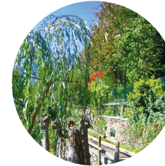
Solà irrigation canal