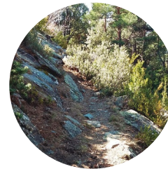
Roc de l'Àliga path