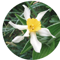
Wild daffodil ( Narcissus Pseudonarcissus )

Laurèdia: according to Joan Corominas, is the ancient name for Lòria (Sant Julià de Lòria), which according to the Act of consecration of the cathedral of La Seu dated 839, is a Latin name for a person Lauridius , although it might also come from Salòria as it seems to contain the same ending, and in this case the use of the article "sa" would indicate a name referring to water.