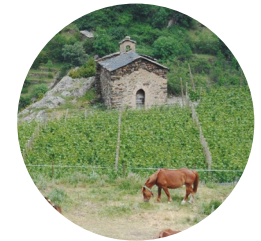
Sant Mateu de Pui d'Olivesa

Fantastic circular route in Sant Julià de Lòria parish, where you can discover the best known places in the south valley. The alternation of open areas with amazing views over the parish and imposing woodlands make this a very interesting route for enjoying landscapes.