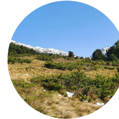
Pla de Bordetes