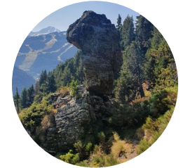
Roca de l'home dret

The landscape of Canillo is based on a relief marked by the action of the Quaternary glaciers. The predominant vegetation in this parish is the mountain pine groves ( Pinus uncinata ), as well as some deciduous trees such as the silver birch ( Betula pendula ), the aspen ( Populus tremula ) or the pussy willow ( Salix caprea ).