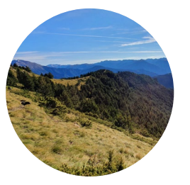
Coll de Turer

Alt de la Capa is a peak with a height of 2,572 metres, and is considered the viewpoint of Pal and Arinsal. This pyramid-shaped peak cannot go unnoticed and moves everyone, whether or not they love the mountains.