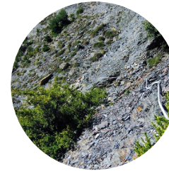
Stretch equipped with fixed rope