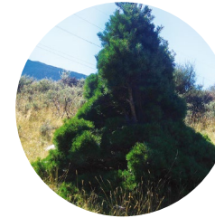
Dwarfism in Finestres pass