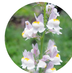
Toadflax ( Linaria repens )