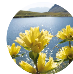
Yellow gentian ( Gentiana burseri )

Angonella Valley, which is surrounded by the mountains of Ordino, is one of the few entirely unspoilt spots in the Principality of Andorra. It's an extremely valuable and well-preserved natural area. Thanks to the harshness of the route, the ponds found here remain isolated and pristine, as opposed to those found along the more crowded and common routes.