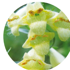
Purple foxglove ( Digitalis lutea )