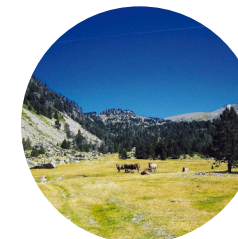
Pla de l'Inгла

The diversity of habitats that make up the Madriu-Perafita-Claror valley contribute to the presence of a large variety of animal species, which have found it to be an ideal home. The mountain passes that connect neighbouring countries are also natural corridors that increase the biodiversity of the area.