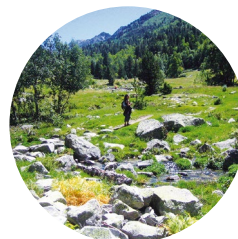
Fontverd livestock pen