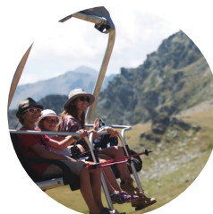
Ceussans chair lift