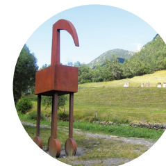
Sculpture along the Ruta del Ferro

Jacint Verdaguer was a priest and also one of the most important Catalan writers of the Catalan Renaissance ( Renaixença ). He was born into a modest – but not uneducated – family in Folgueroles in 1845. From a young age he discovered his interest in popular traditions and during his time at the seminary in Vic he received an ecclesiastical education and became familiar with rhetoric and the classics while also writing poetry. His works include the romantic epic poems l'Atlàntida and Canigó , as well as the poetry collections Idil·lis i cants místics , Pàtria , Montserrat , Flors de calvari and Aires del Montseny . Other published works include Excursions i viatges ,