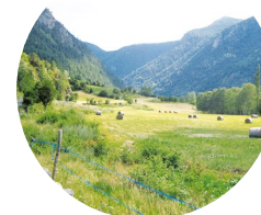
Meadows in Arans