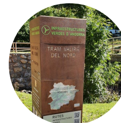
Camí Ral sign