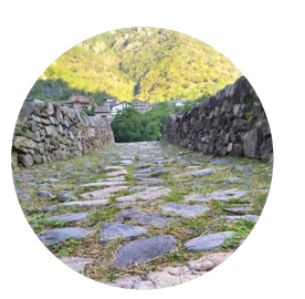
La Margineda Romanesque bridge