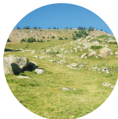
Orris de Mateu

Maiana: Old form of the Catalan word mitjà , meaning "middle"; the point between two well-defined extremes or places. It can also refer to division between two different properties or possessions.