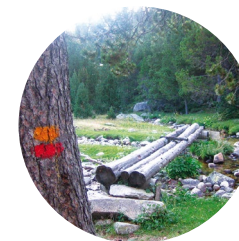
Estall Serrer walkway

The Maiana route is one of the most spectacular routes in the Madriu-Perafita-Claror valley, as it passes by Entremesaigües, the Perafita refuge and Maiana pass, with the option of visiting Nou lake. On the way down, you'll pass by the Fontverd and Ràmio refuges (typical groupings of huts found in Andorra).