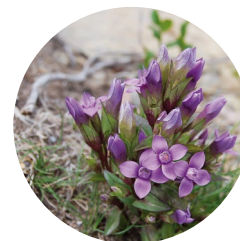
Field gentian ( Gentianella campestris )