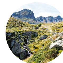
Les Abelles path

Les Abelles lake is at the head of the Arieja river basin, which is a tributary of the Garonne river. This river is a natural line that sketches out the French-Andorran border, providing it with both an Andorran and French side.