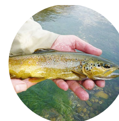
River trout ( Salmo trutta fario )