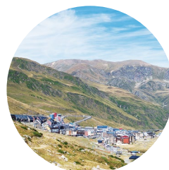
El Pas de la Casa